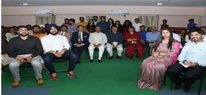
The dignitaries and participants of the 15th National Youth Parliament conducted under the aegis of Ministry of Parliamentary Affairs, Govt. of India

DME conducted the 15th National Youth Parliament on 23th october, 2018 which is conducted under the aegis of Ministry of Parliamentary Affairs, Govt. of India, New Delhi. Out of many prestigious universities and colleges across India, DME got the opportunity to conduct the 15th National Youth Parliament.